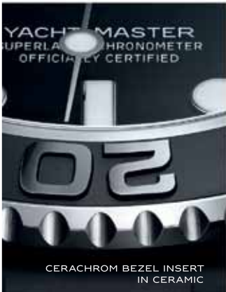
CERACHROM BEZEL INSERT IN CERAMIC