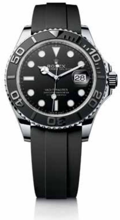
OYSTER PERPETUAL YACHT-MASTER 42 IN 18 CT WHITE GOLD